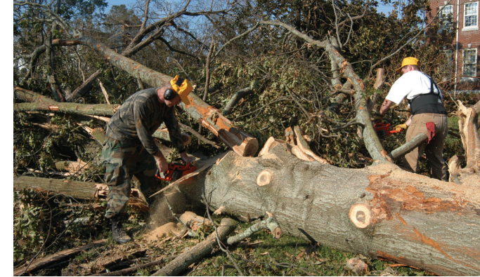
EDENTON, NC, SEPTEMBER 21, 2003 -- WORKERS SAW A TREE FALLEN BY HURRICANE ISABEL IN THE HISTORIC DISTRICT..

By selecting appropriate trees, planting them in the proper location and giving them the care they need, homeowners can go a long way toward not only beautifying but also protecting their property.